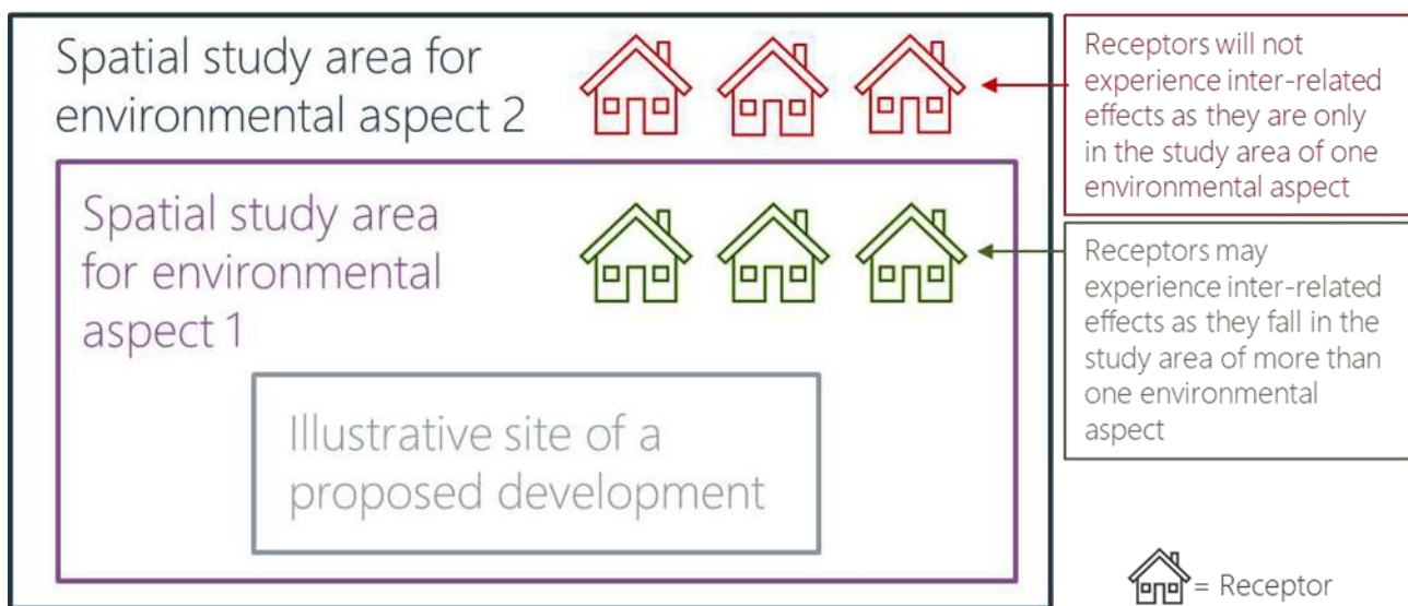
Graphic 17-1 Illustrative example of the spatial scope and study area for an example receptor

17.7.2. The study area for each of the individual environmental topics ( Chapter 6 to Chapter 16 ) relevant to this chapter have been informed through desk study and engagement with stakeholders.